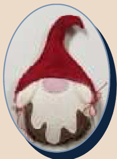
Like this crafty little Norwegian Nisse

Many beautiful quilted or sewn items, PLUS baked goods will be available for purchase!