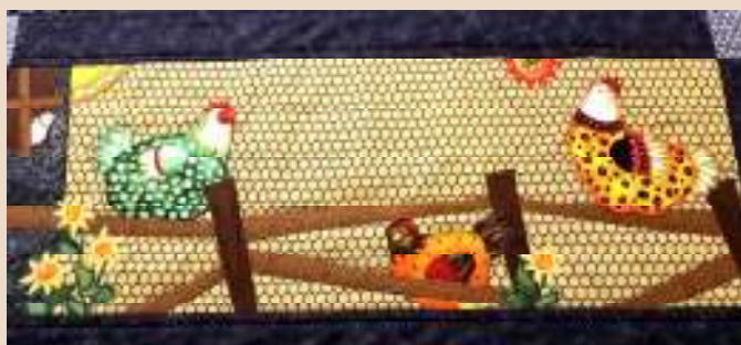
Or this beautiful quilted Chicken Table Runner